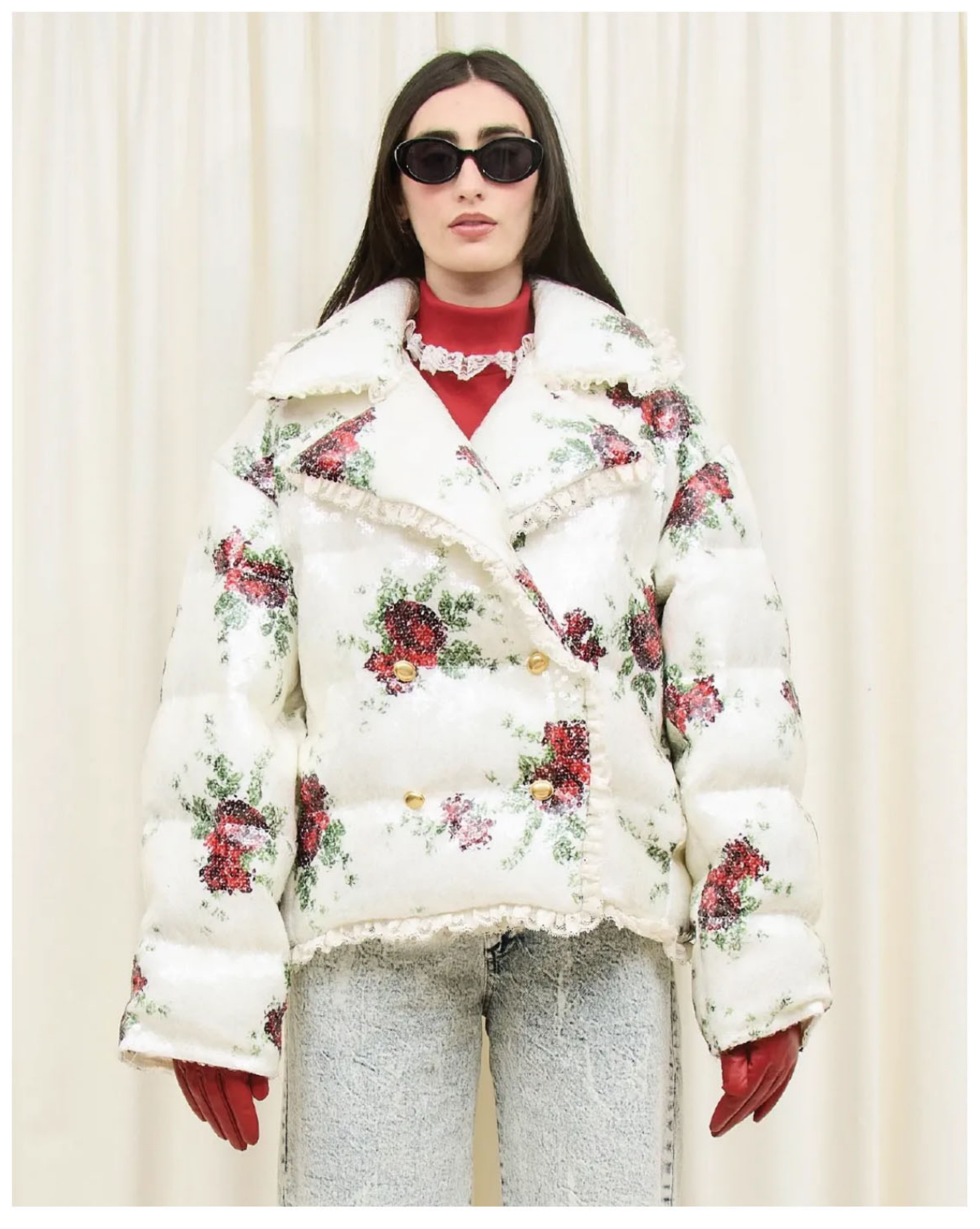
Tanner Fletcher's Rita Sequin Puffer Coat